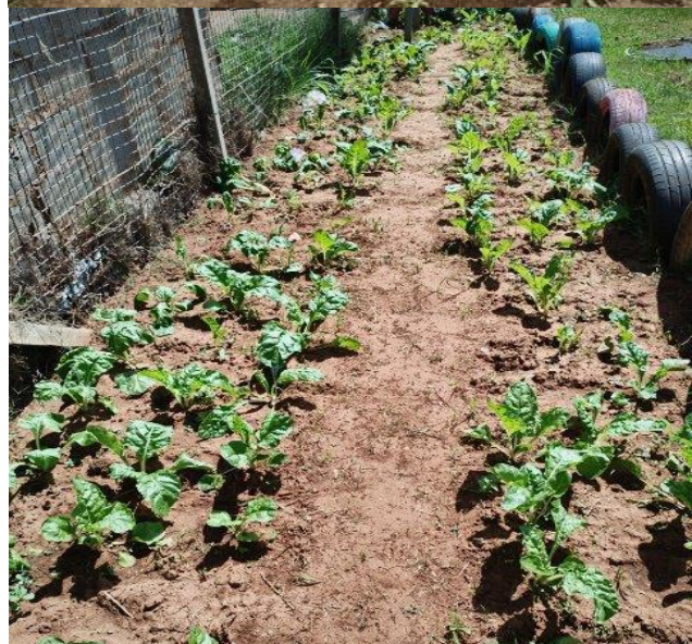
All pictures, above; land preparation, planting, watering, and vegetable growth across project sites