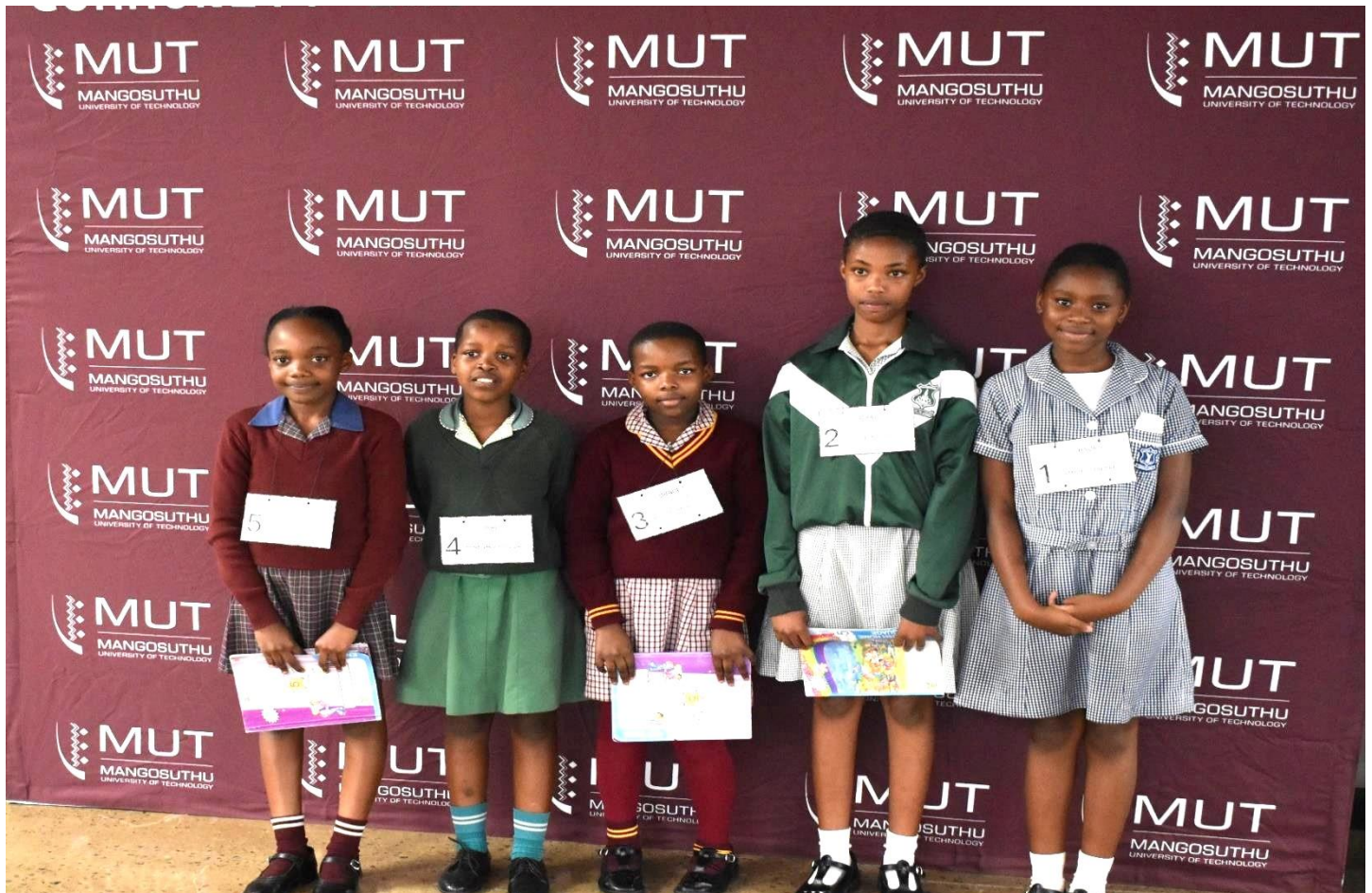
Learners representing their respective primary schools pose for a photo before heading off to compete for the top prize

MUT hosted its third Reading Competition under the flagship MUT Reading Project on Thursday, 25 September 2025. The event drew more than 100 participants, including learners from eight primary schools: Ngilosini, Sukuma, Emthethweni, Embonini, and Umgijimi from Umlazi, as well as Mariannridge, Chief Lokothwayo, and Kwamanzini from Pinetown, alongside educators, principals, and partners from the Department of Education, eThekweni Municipality, local libraries, and Shuter & Shooter Publishers.