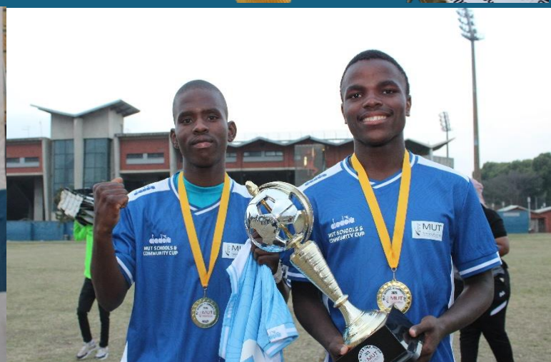
Winning soccer players in high spirits