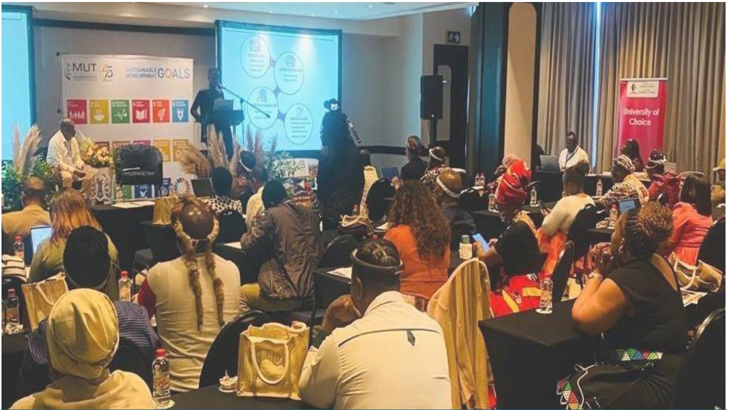
Academics, students, traditional health practitioners, and community members gathered at MUT for the 2025 Traditional Medicine Symposium

The Traditional Medicine Symposium, held on 28 August 2025 at MUT, brought together a mix of academics, students, traditional health practitioners, and community members for a meaningful day of dialogue and knowledge sharing.