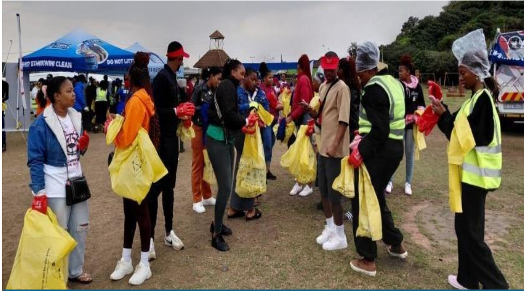
MUT students participating in the global coastal clean-up campaign

In celebration of International Coastal Clean-Up Day on 20 September 2025, MUT students joined hands with eThekweni Municipality and other partners in a large-scale beach clean-up campaign at Dakota, Cuttings and Reunion beaches. The initiative, part of MUT's Ngqayizivele Student Volunteerism and Green Initiative for Climate Change Projects, gave students a hands-on opportunity to contribute to environmental preservation while learning about the growing importance of the ocean and green economies.