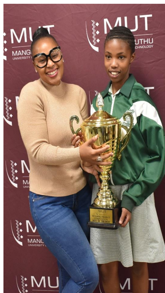
A joyful moment shared between an educator and a learner from Marriannridge Primary School