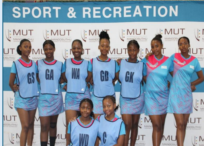
Celebrating the talent and spirit of learners in chess, soccer, and netball at the event