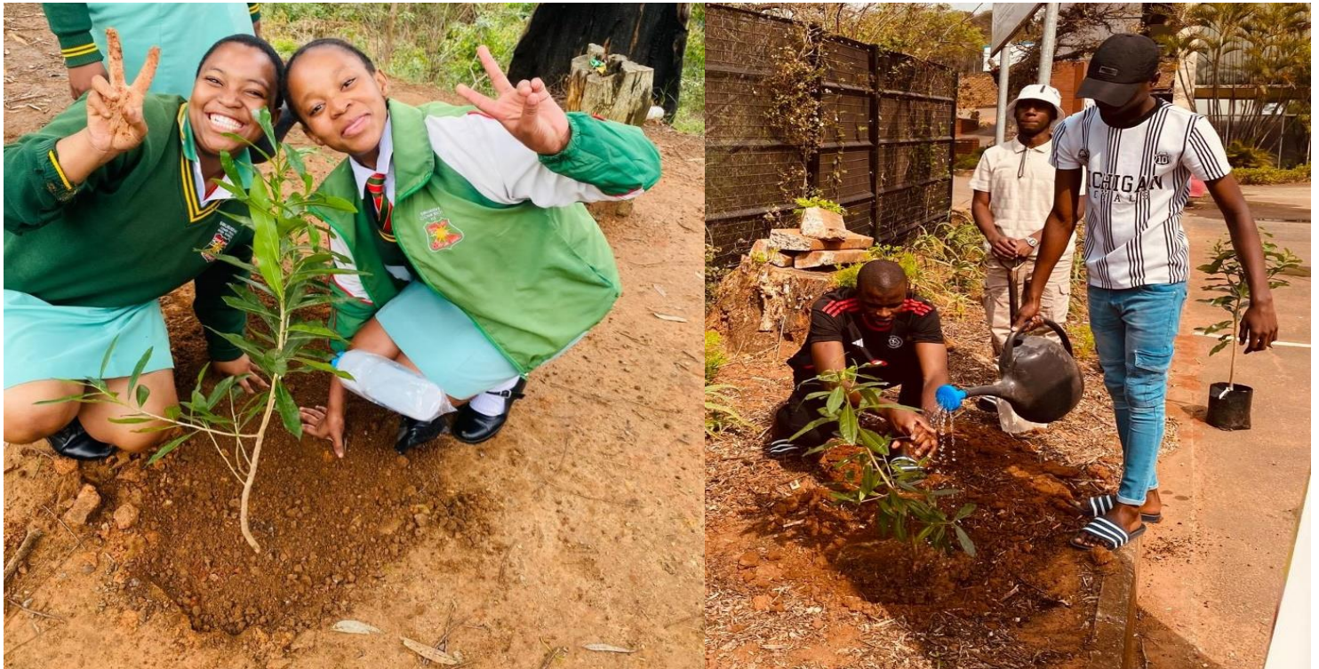
Seedlings being planted at Sibusisiwe Comprehensive Technical College in Umbumbulu and at MUT North Campus