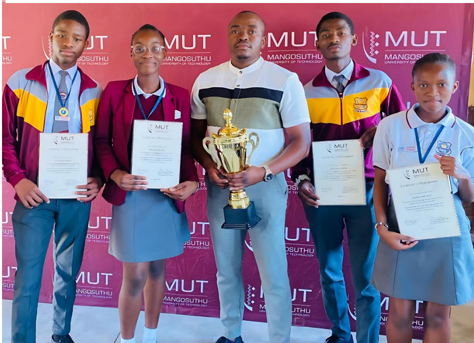
Participating learners and their educator proudly display their certificates and trophy earned at the competition