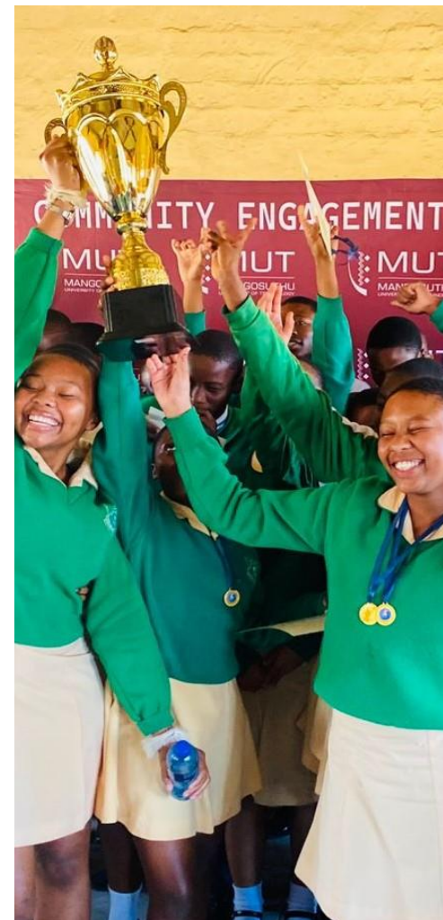
Excited participating learners raise their trophy in celebration of victory

The competition also highlighted the transformative power of STEM education in township schools. It created a dynamic platform where learners could test ideas, solve problems, and present their findings with creativity and confidence. The enthusiasm and originality displayed by the participants reflected a growing spirit of innovation that aligns with South Africa's vision of empowering youth through education and scientific advancement. This event showcased MUT's commitment to promoting education, equity, and opportunity, reminding all involved that when young minds are given the tools and encouragement to explore, they can illuminate the path to a brighter future.