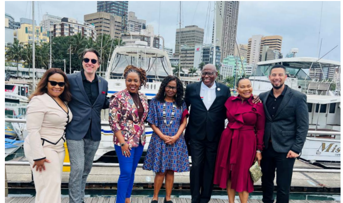
Sac State delegation and MUT staff and a Gauteng government representative at the Durban Harbour

As part of the recent visit by California State University, Sacramento (Sac State), the delegation joined MUT representatives for an enriching cultural experience at the KwaMuhle Museum in eThekweni on 6 November 2025. The museum, a historic landmark that once served as the Native Administration Department, offered the visitors a profound glimpse into South Africa's complex past and its journey toward transformation.