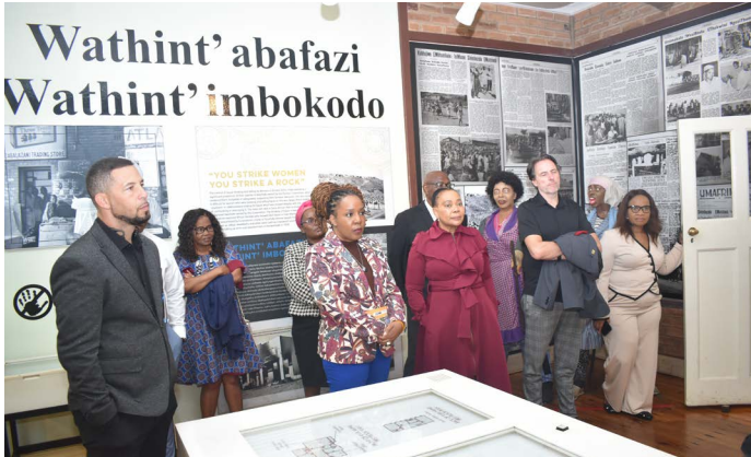
Sac State and MUT staff and a Gauteng representative at KwaMuhle Museum