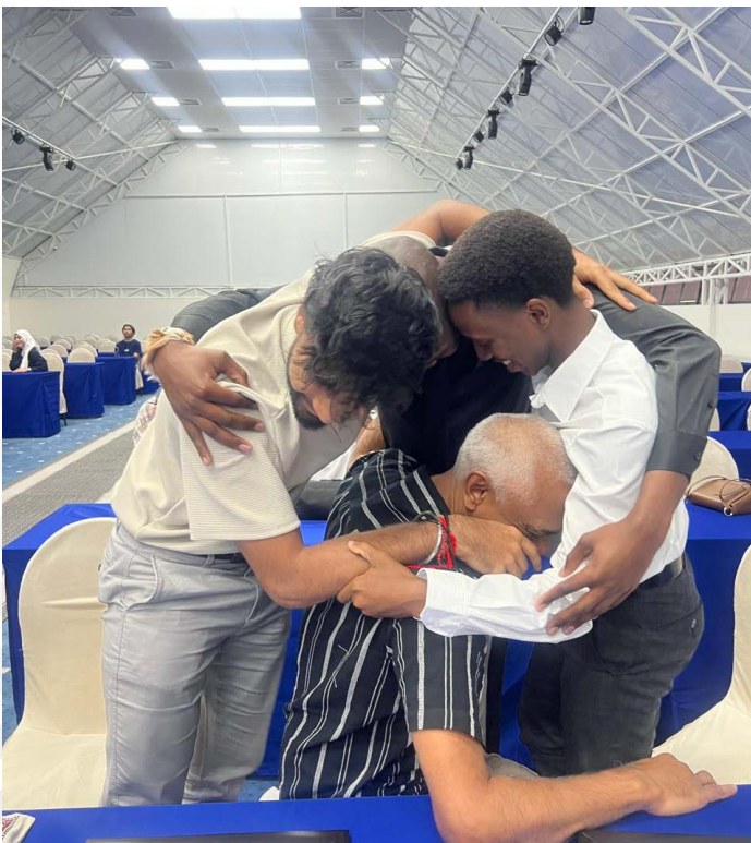
An emotional moment as MUT is announced Champions of the hackathon

When Team CODENEXUS from Mangosuthu University of Technology (MUT) was announced as the winner of the 2025 International Young Innovate Hackathon in Tashkent, the applause was not just for their technical brilliance, it