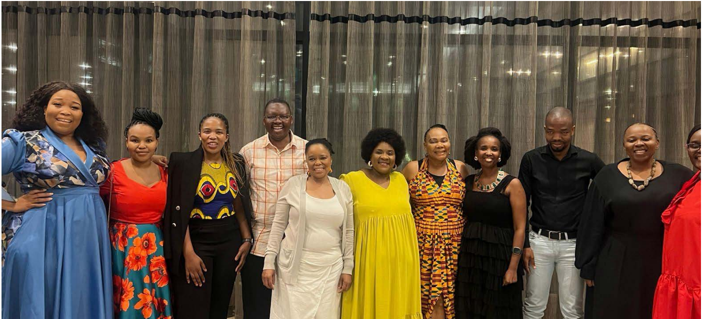
A victory for all at MUT, staff celebrate the VC's achievements