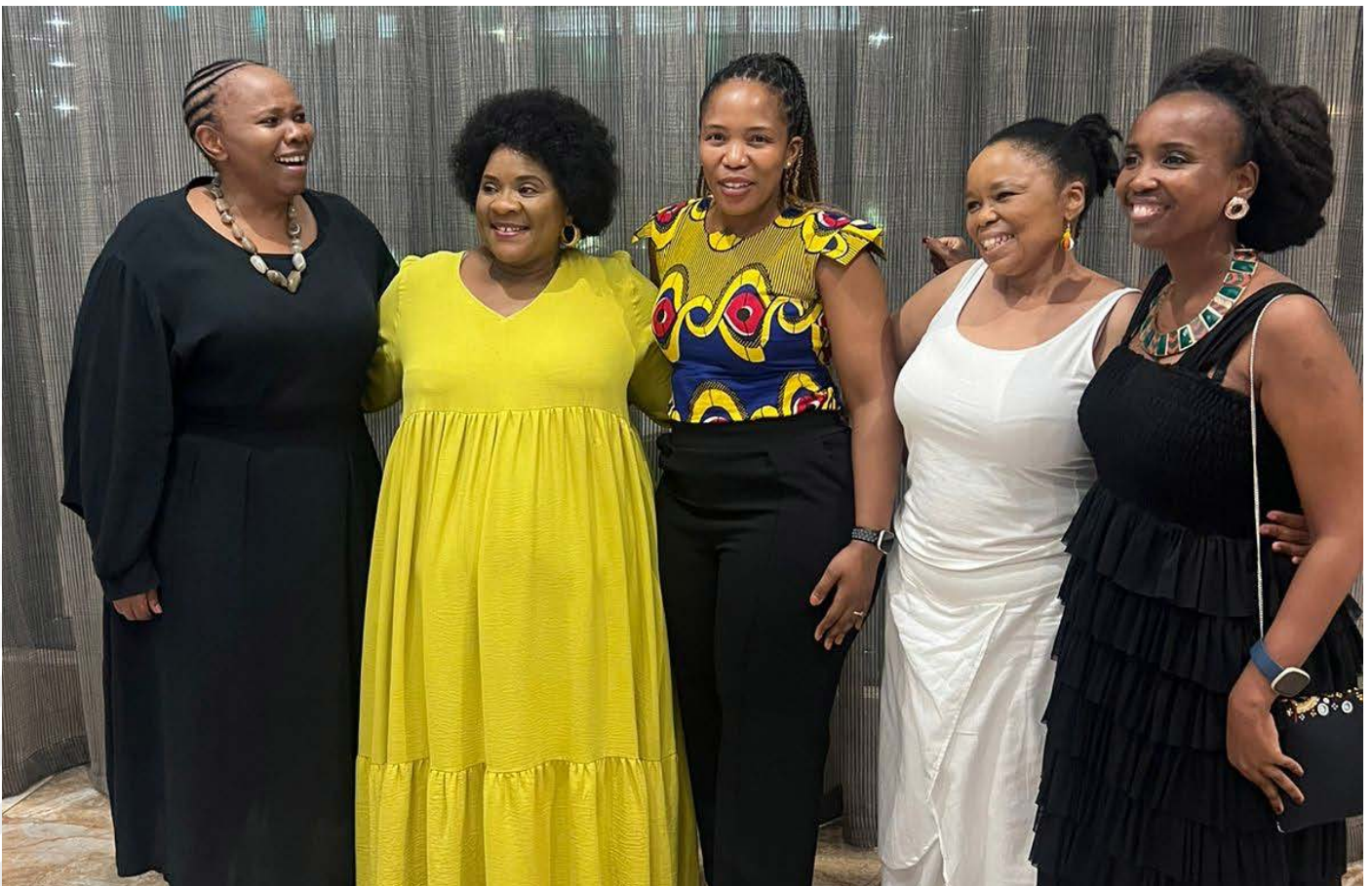
A victory for all at MUT, staff celebrate the VC's achievements