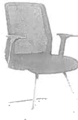
546722 Ranger Medium Back Visitors Armchair

Chrome sleigh base. Mesh back. Upholstered seat.