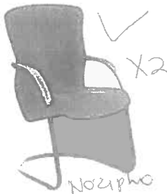
544135 Bodyline Visitors Armchair