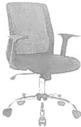
546721 Ranger Medium Back Operators Chair

Swivel & tilt mechanism. Chrome base. Fixed arms. Mesh back. Upholstered seat.