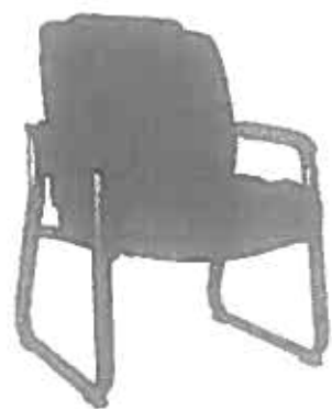
Recommended Visitor Chair: Empire 4 legged