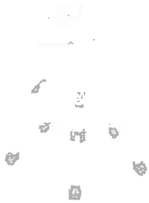
546768 Como Medium Back Operators Chair

Grey back with white steel base. Swivel & tilt mechanism. Rotating arms with mesh & upholstery.