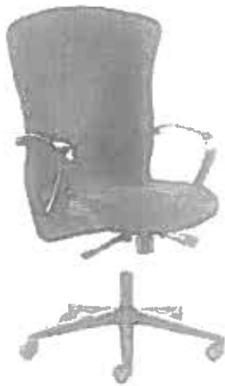
543916 Bodyline Highback Chair