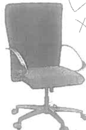
544111 Super Max Highback Chair

Donati Synchrom mechanism. Side tension adjustment. Nylon base. Flexi arms.