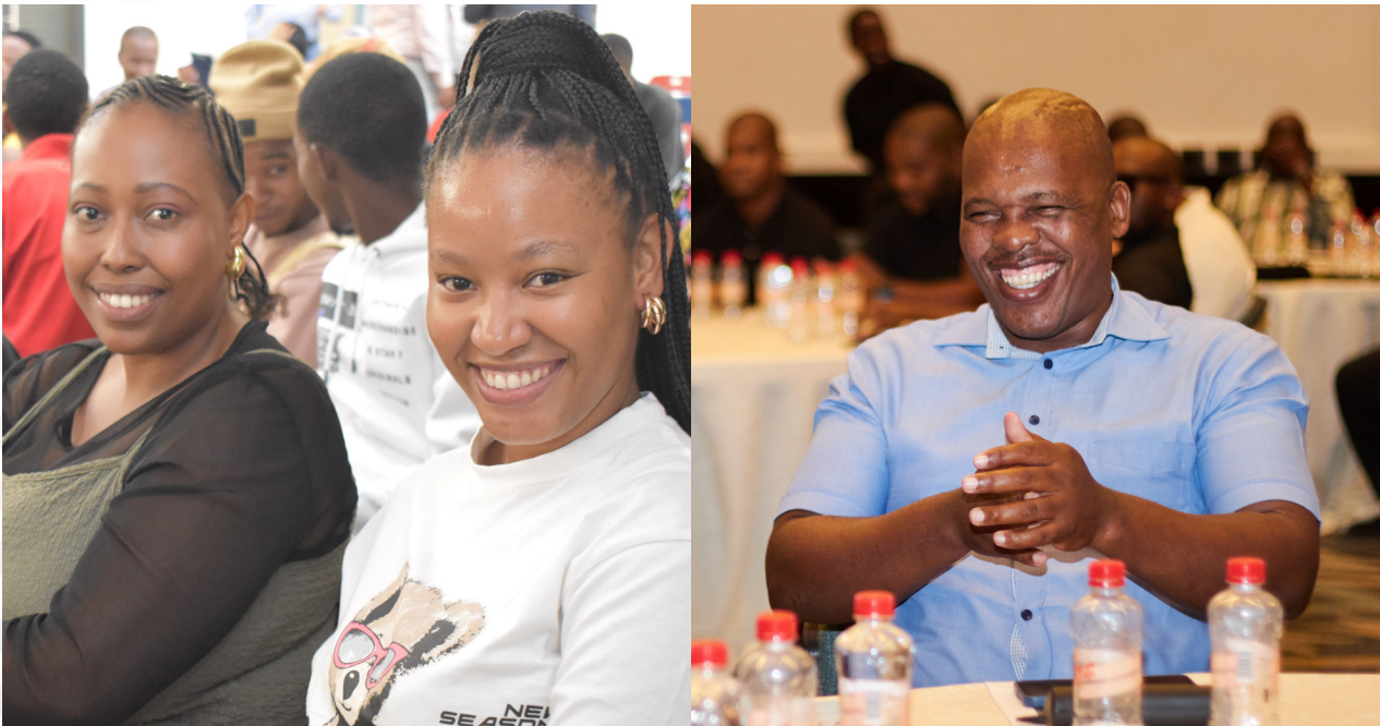
Some of the happy MUT faces

As MUT boldly strides toward its Vision 2030 goals, one undeniable truth shines through: This institution is not merely transforming; it is leading a movement. Through unwavering commitment, collaboration, and a vision fuelled by inclusivity, MUT is shaping a future where every individual can thrive, and every voice matters. Together, they are not only envisioning change but courageously creating it.