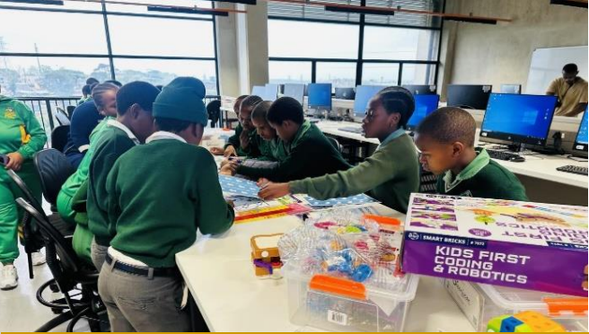
STEM robotics Education and 4IR Development Project

STEM education became the beacon of opportunity for young minds in 2024 through a STEM Robotics Education and 4IR Development Project which brought futuristic learning to two Umlazi primary schools. Fourty learners who had never encountered coding or programming just months earlier successfully built mini robots within a space of 14 weeks.