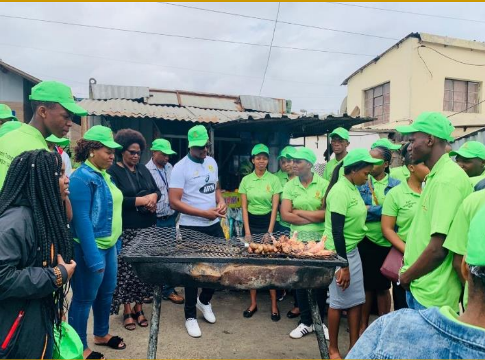
Food Safety Training Project