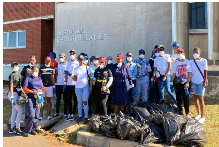
Cleaning campaign: Mandela month initiative 2024

Throughout July 2024, MUT was transformed into a living example of Ubuntu in action. The university community - staff, students, and project leaders, stepped out of lecture halls and offices to serve society through dozens of community-based activities.