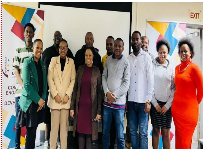
Research-related community engagement for outputs workshop 2024

Community Engagement Research and Science Communication Workshops: CEAD strengthened the research capacities of academic staff through targeted workshops on integrating research into community engagement, producing scholarly outputs, publishing, conference presentations, and science communication.