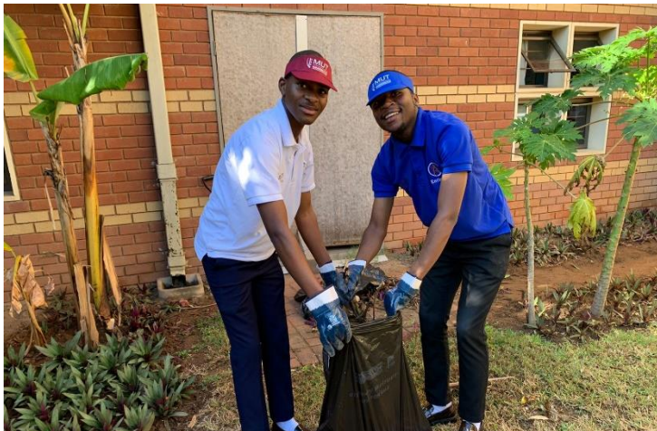
MUT students volunteering during Mandela Month 2024

The lessons learned during these engagements does not stop when a project ends. MUT student volunteers become ambassadors of service, carrying their values into their academic pursuits, their future careers, and their families. They learn that giving back is not seasonal — it is foundational.