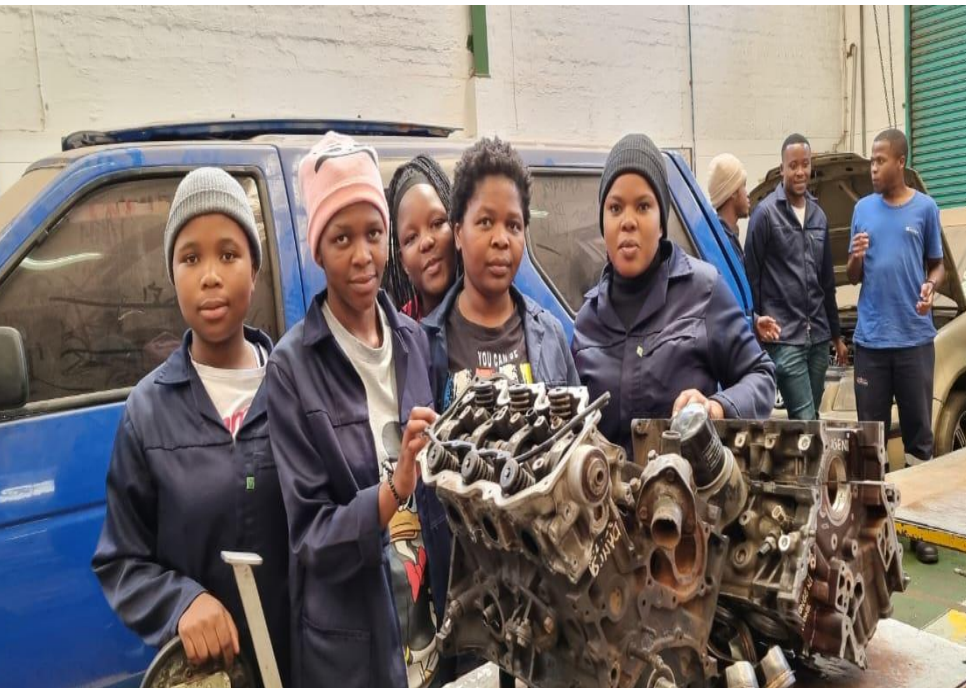
The Motor Vehicle Mechanic Repair Project