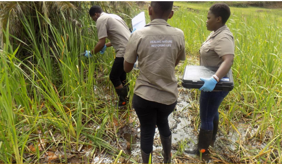
Ecosystems Rehabilitation and Restoration Project