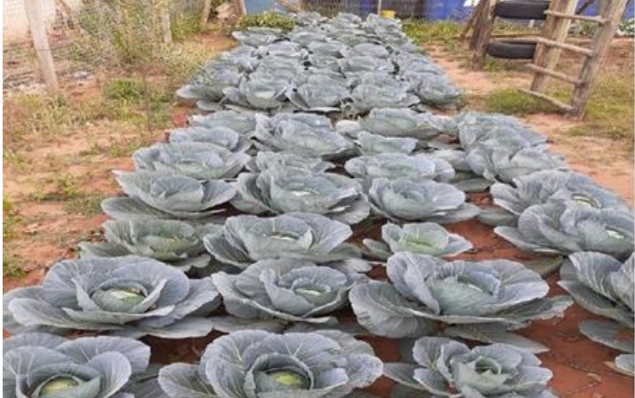
Food Security and Better Health Project

Addressing hunger and promoting health were front and centre in 2024. Through projects such as Food Security for Better Health (FSBH), primary school learners in Umlazi were taught to cultivate their own food gardens.