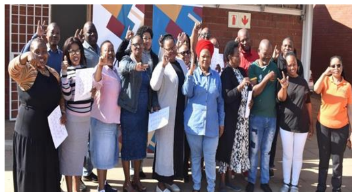
Sign language workshop 2024

In July, as part of Mandela Month, Sign Language Workshops were facilitated by the community organisation Incamisile Intokozo. Attendees included various MUT divisions. The initiative promoted inclusivity by empowering participants to engage with hearing-impaired individuals—a critical step towards inclusive community engagement.