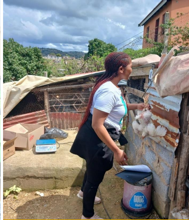
Agricultural Support Project