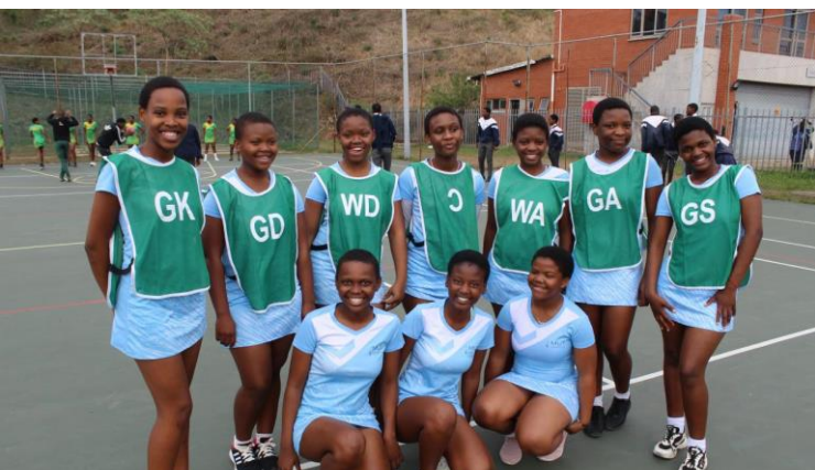
MUT Schools and Community Cup 2024

Academic requirement for participation: Learners had to achieve 80% or above in all subjects, blending the pursuit of knowledge with physical excellence.