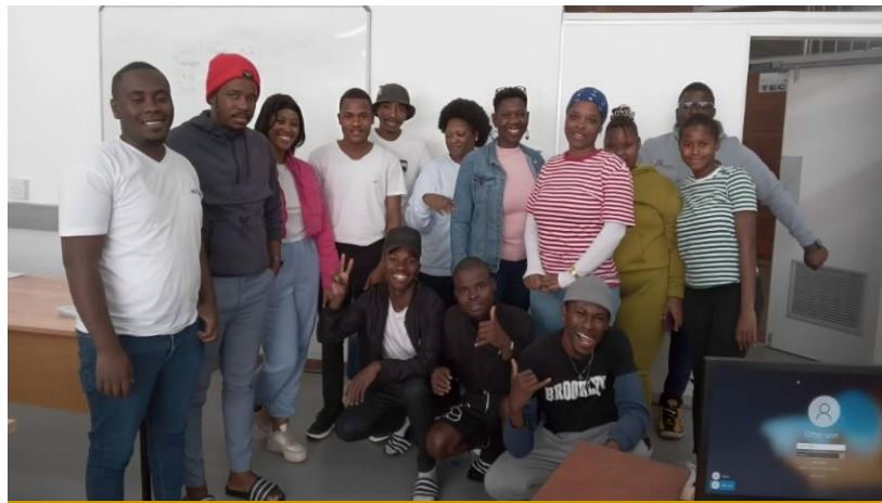
Impilo Community Project

Recognising that sustainable change demands skills, MUT launched initiatives such as the Sithola Ulwazi Entrepreneurial Skills Development Project, the Impilo Community Project, and the Isisekelo Campaign. These projects equipped unemployed youth in Umlazi and Dassenhoek, near Pinetown, with business acumen, life skills, and entrepreneurial mindsets.