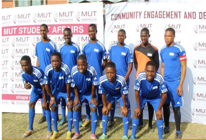
MUT Schools and Community Cup

MUT proudly waved the banner of unity and inclusion through projects that celebrated literacy and community spirit.