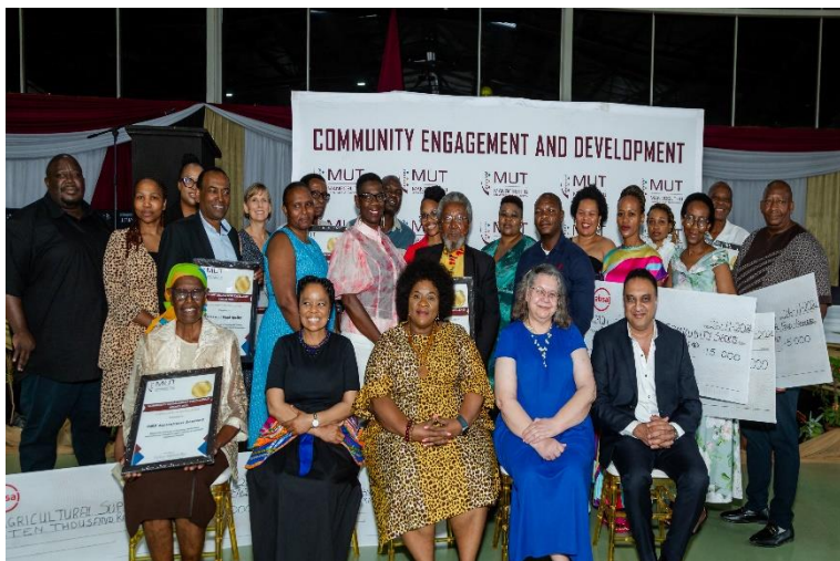
CE Excellence Awards 2024

Awarded partners included Toyota, eThekweni Municipality, Sivusisizwe Boyz 2 Men Africa Initiative, DMZ Agricultural Academy, Impilo Home, SEDFA, Azibuye Digital Solutions, Moses Kotane Research Institute, Vumengazi Traditional Authority, and Ikamva Youth. The awards had a significant impact, boosting project leaders’ morale and visibility, strengthening partner relations, and institutionalising a culture of excellence and recognition.