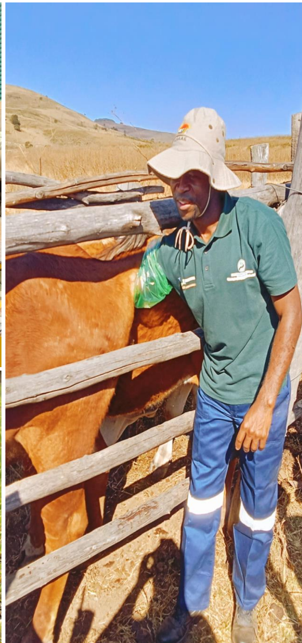
Assisted Reproductive Technology Project