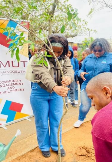
The EES Project

Project and the Environmental Education and Sustainability (EES) Project. The projects mobilised many community members through a series of impactful activities. These included coastal clean-ups, wetland rehabilitation efforts, and tree-planting campaigns.