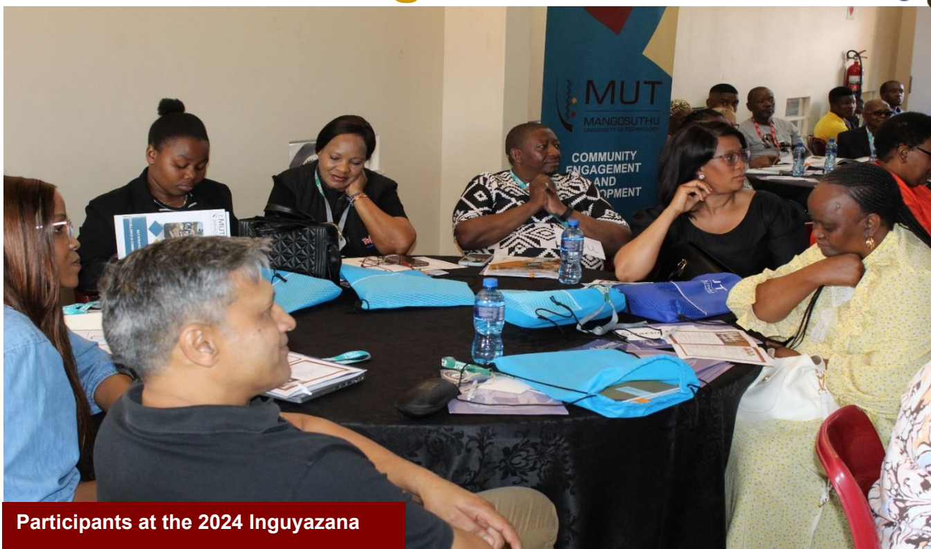
Participants at the 2024 Inguyazana

The 2024 Inguyazana event, hosted by the CEAD Directorate, brought together 75 participants representing academia, government, non-profit organisations, schools, and community groups. Held at Seme Hall on 17 October 2024, the event was themed "Reflections on the Progress of CEAD Programmes, 2024." It served as a significant platform for stakeholders to engage in critical dialogue on MUT's ongoing community engagement initiatives and future strategies.