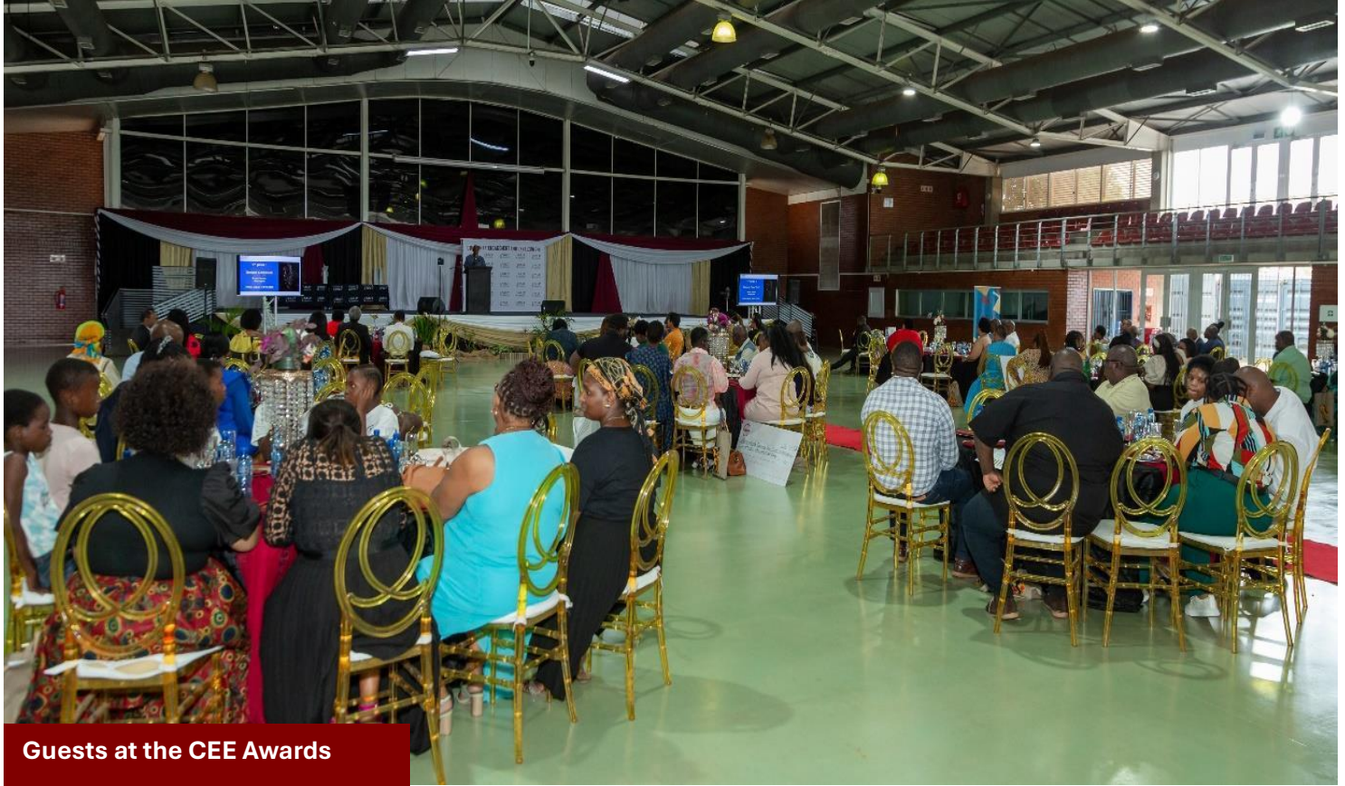
Guests at the CEE Awards