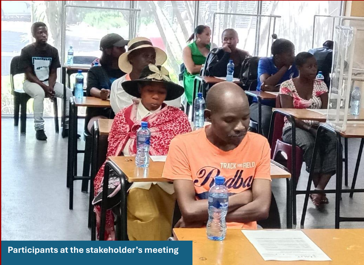
Participants at the stakeholder's meeting