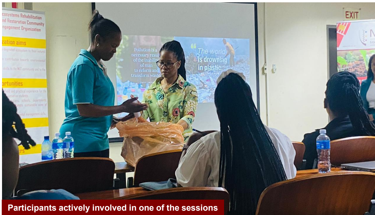
Participants actively involved in one of the sessions