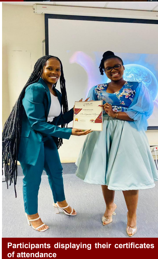
Participants displaying their certificates of attendance

The seminar featured informative presentations, lively discussions, and enthusiastic participation from attendees, highlighting the collective commitment to raising awareness and promoting environmental stewardship. It was a successful event, reflecting MUT's dedication to fostering positive environmental actions.