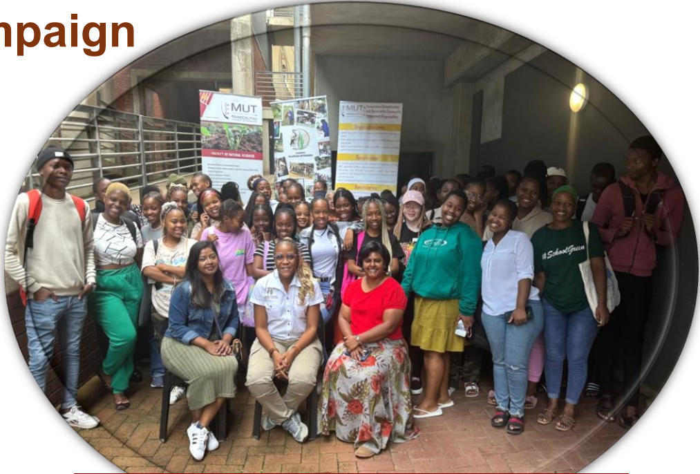
Participants at one of the iNaturalist training session

These sessions culminated in the iNaturalist Competition from 26-29 April, where MUT and Ndukwenhle students made over 1,000 plant and animal identifications.