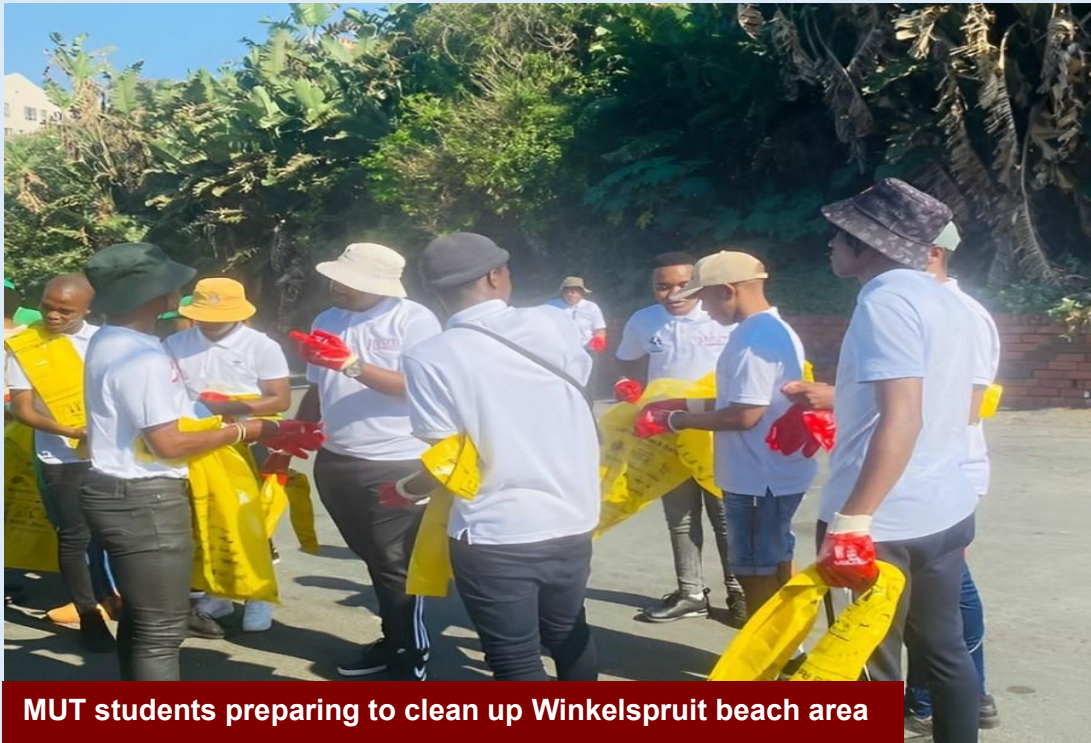
MUT students preparing to clean up Winkelspruit beach area