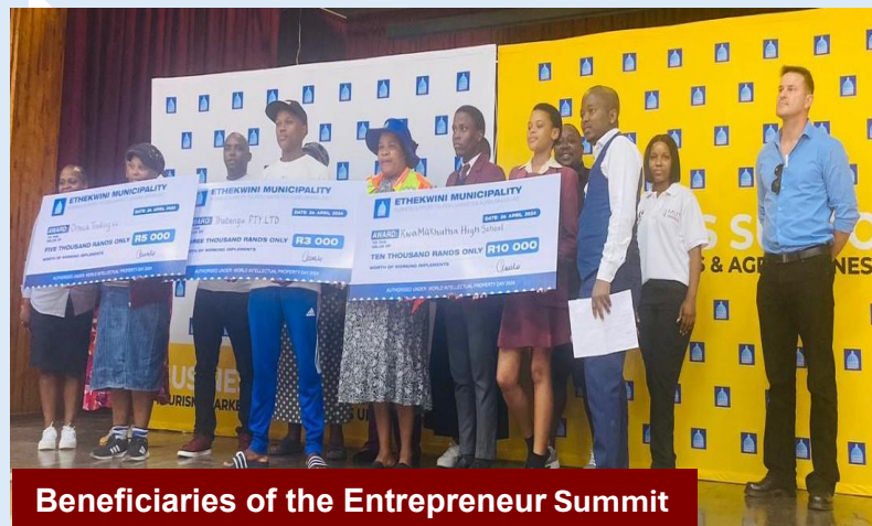
Beneficiaries of the Entrepreneur Summit

Participants were inspired to apply their knowledge towards addressing community challenges and initiating entrepreneurial ventures. Moving forward, Sithola Ulwazi Entrepreneurial Skills Development (SUESD) plans to conduct follow-up sessions, promote entrepreneurial initiatives, and foster partnerships to support community upliftment efforts, reinforcing its commitment to community