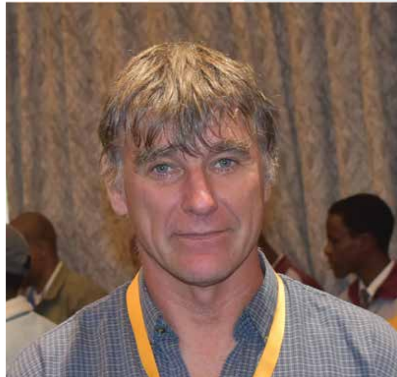
Professor Endre Dobos

He also said that soils in many parts of Africa have a low content of organic matter, which is very important to create a soil structure which increases water filtration, has higher water retaining capacity, and allows for much safer agriculture. “It is very important to keep the crop residues and use cover crops to