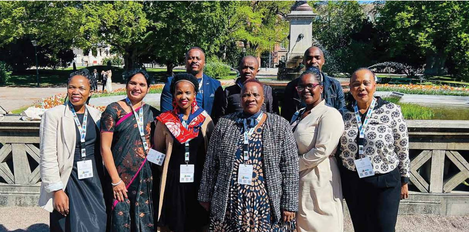
The MUT delegation that went to Sweden