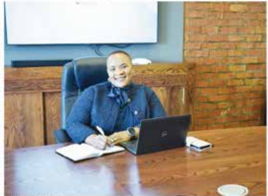
▲ First woman VC at SA.

going up and cutting the grass. That is the kind of life that I went through. But I always looked on the positive side because it taught me to ensure that my ex-