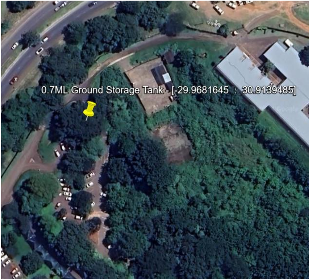
Figure 2: MUT Location 2 – 1ML Ground storage Tank Proposed Geotechnical Investigation Point, Google Earth 2024