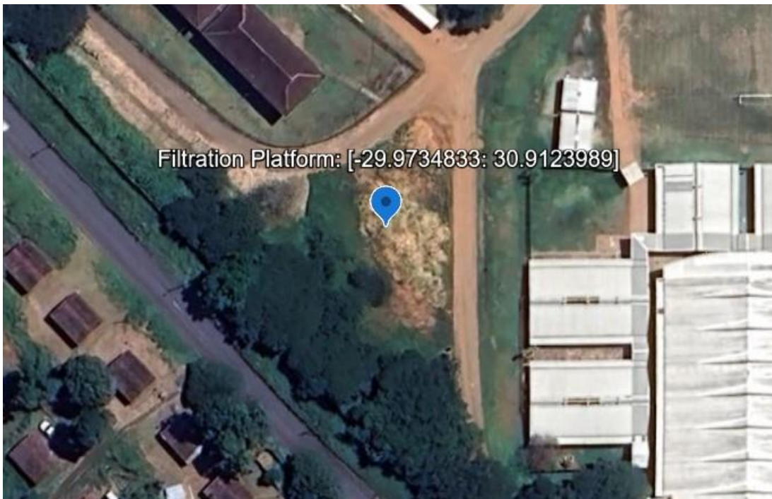
Figure 3: MUT Location 3 – Existing Filtration platform Geotechnical Investigation Point, Google Earth 2024