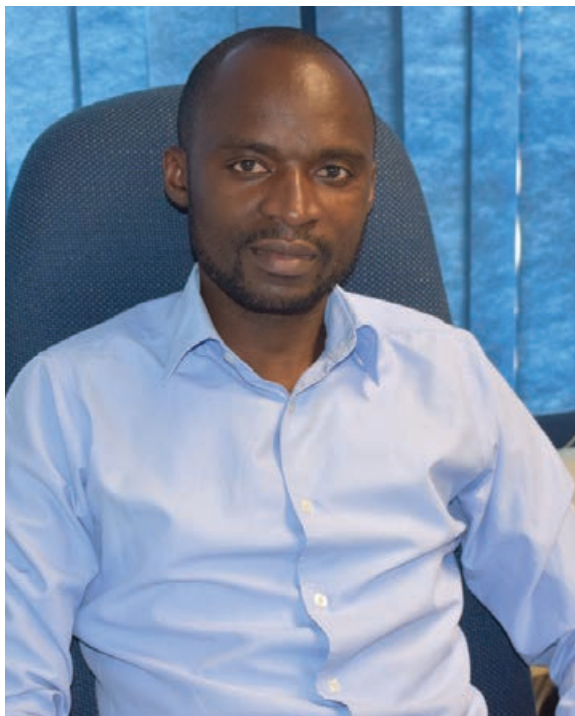
Dr Papy Numbi

Lasich, M. (2021) Separating Binary Gaseous Mixtures of Ethene+ Ethyne Using Cement Hydrate: A Multiscale Computational Study. ACS Omega https://doi/10.1021/acsomega.1c02902 .