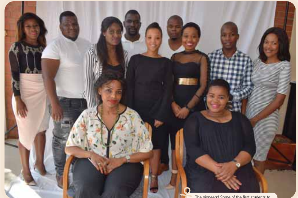
The pioneers! Some of the first students to graduate with a Postgraduate Diploma in Human Resources and Management

MUT programme offering is getting better and better. Year 2019 has seen the first cohort of students graduating with the inaugural Postgraduate Diploma in Human Resources and Management.