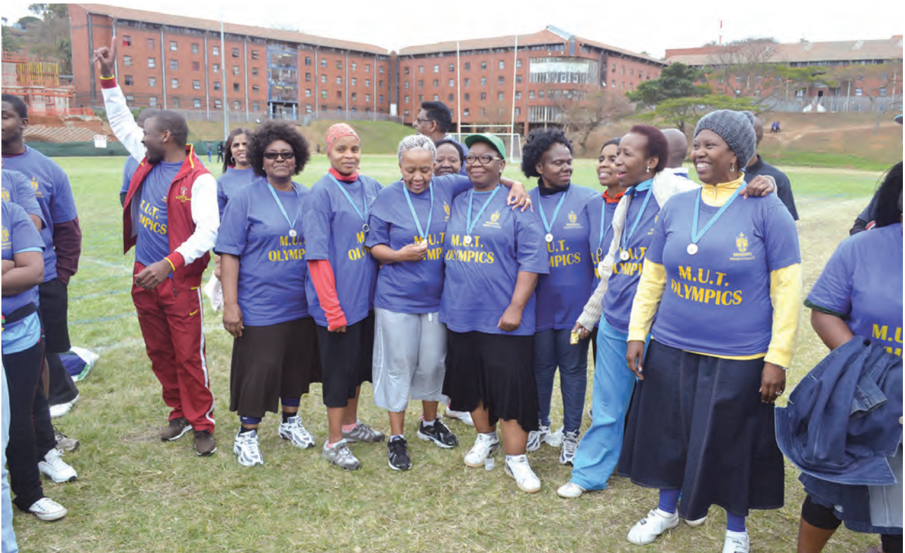
Medal winners at our inaugural MUT Olympics.