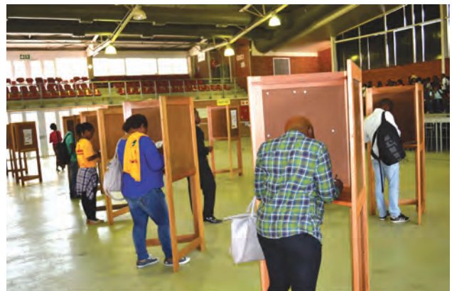
The 2014 SRC elections went off without problems. Here students are casting their votes, using booths used in South Africa's first ever democratic elections in 1994.