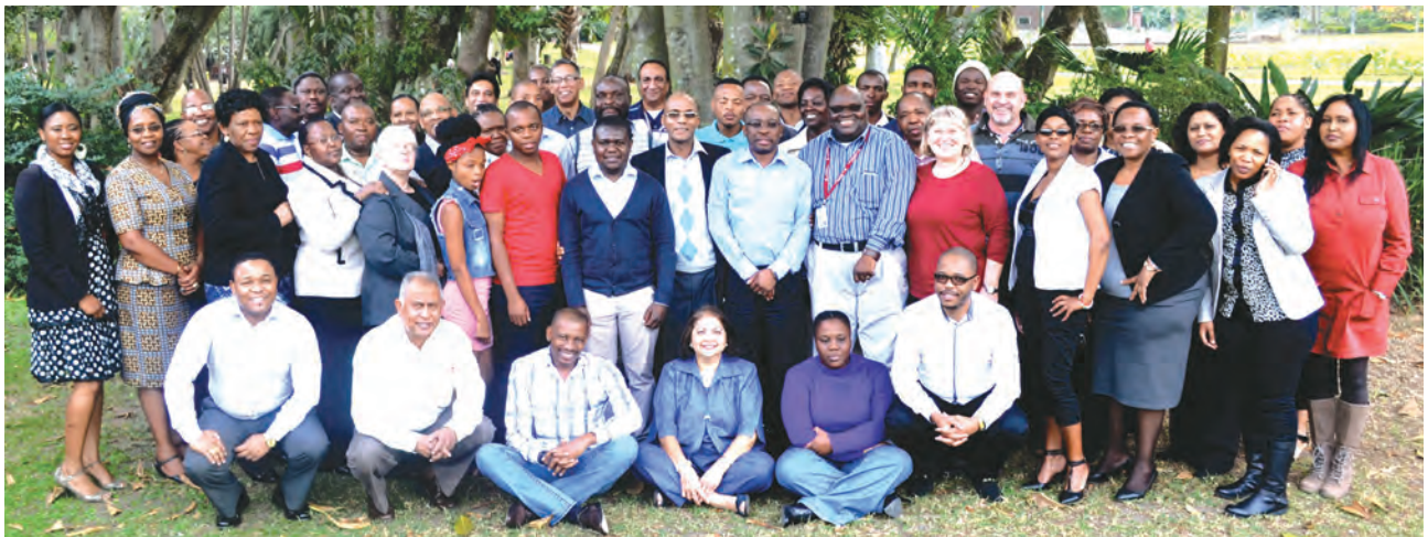
Achieving quality is crucial for our academic programme offerings. The Quality Enhancement Project is a process that draws in all our stakeholders in a process that debates and consolidates our ideas into a whole that contributes to our improved product and services offerings.