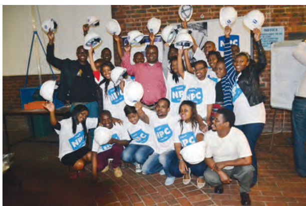
MUT continues to excel in the annual Egg Protection Device Competition.