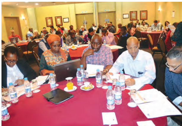
Hard at work! Staff members during the QEP Seminar sessions.