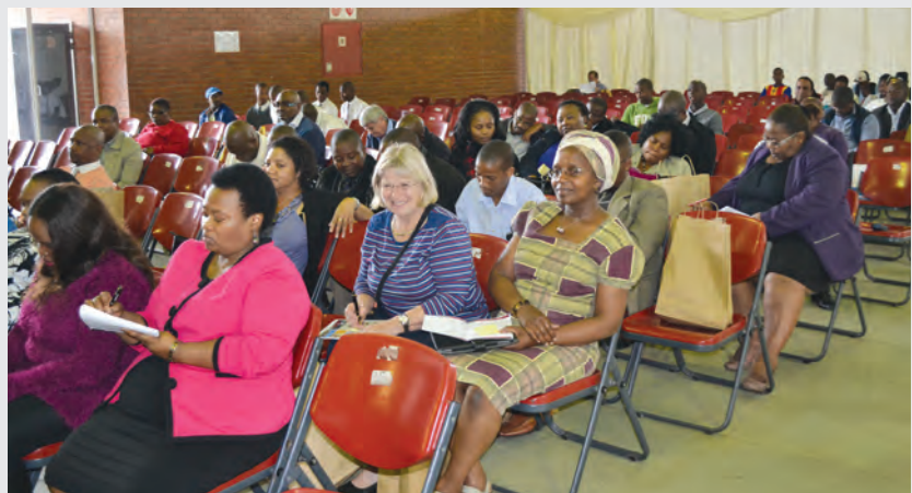
Below: The conference delegates.