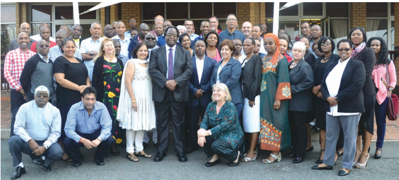
MUT senior staff and guests at the first QEP Seminar held at the Protea Hotel in Karridene.