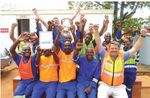
Double winners! The happy Liviero team after being declared winners. MUT's 640-student residence building project won the Liviero Building Safety Award in terms of Act 85 of 1993 as assessed by the Masters Builders South Africa (MBSA) in partnership with National Occupational Safety Association (NOSA).

There were a host of our victories worth celebrating in 2014.