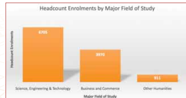
Figure 2: Student Headcount Enrolments by Major Field of Study

The Science, Engineering, Technology (SET) field of study has the most enrolments at 6,705, followed by Business/Management at 3,970 and Other Humanities at 911. (Figure 2 below.) The SET proportion of enrolments is 58% (target: 55%). The field of Business/Management has a 34% share (target: 40%), and Other Humanities has 8% (target: 5%). The proportions are unchanged from 2016.